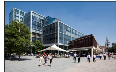
Bishops Square London City, England Office property acquisition £445,000,000