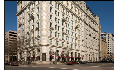
The Evening Star Building Washington, D.C. Office property sale USD$180,000,000