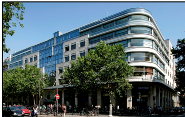
Les Trois Quartiers Paris, France Office property sale €210,000,000