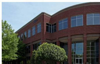
RadarFind 1500 W Perimeter Park Drive 17,000 sf