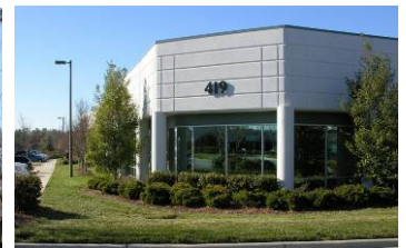
Liquida Technologies 419 Davis Drive 16,000 sf