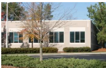
Parata Systems 2600 Meridian Parkway 66,000 sf