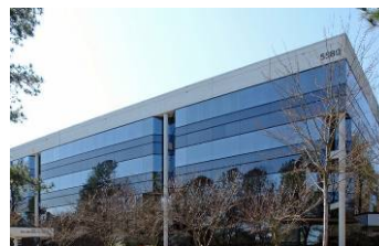
Art.com 5580 Centerview Drive 17,000 sf